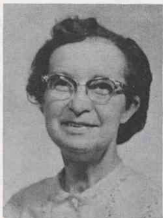
Pearl G. Knox Folder, Plant #1 1936