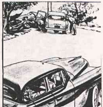
Anticipate accidents blocking roadway.