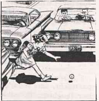
Anticipate unsafe acts of children