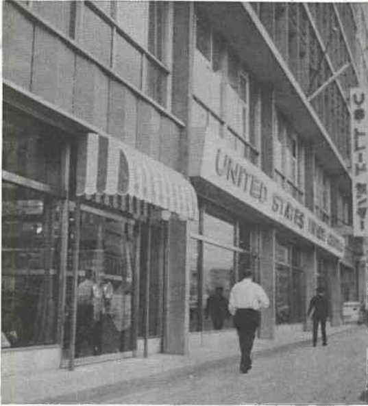
The entrance to the United States Trade Center in Tokyo, Japan, is clearly indicated in English and Japanese.