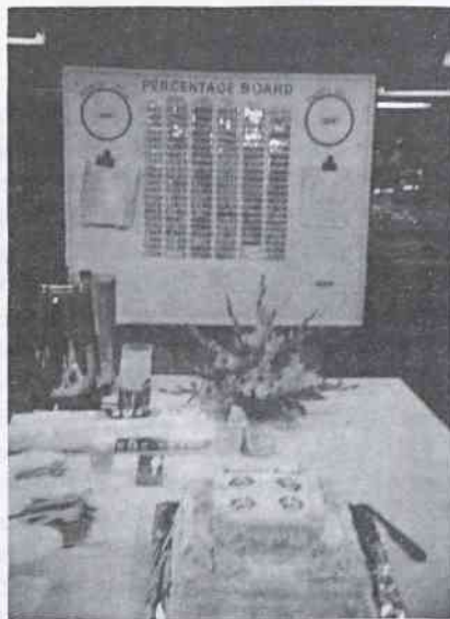
The percentage board and party cake at Plant #2.

The percentage board in the Knitting Department of Plant #2 in Mt. Airy has been in operation approximately two years. At the time it was started, the bad work figure was 17%. The figure has now been reduced to 7.8%, and as a reward for this reduction, the knitters and fixers were given a party. They were served coffee and cake, the cake being patterned after the percentage board.