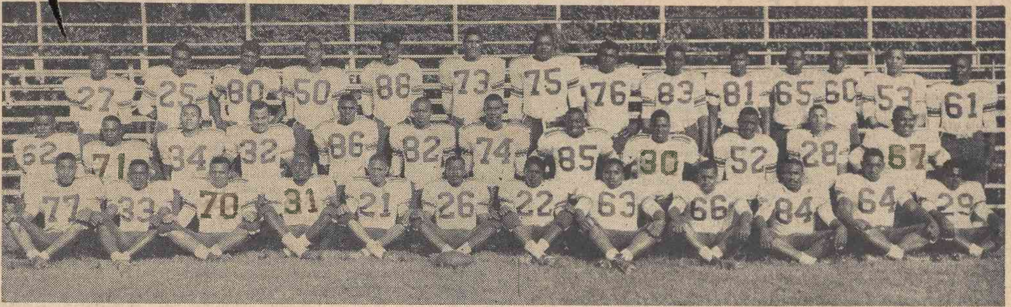
The Eagle gridders, who should give some strong play and cop many victories this season, are shown above in a group picture taken on NCC's O'Kelly Field—the scene of this year's NCC home games.