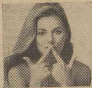
You have to look for the "W" because it's silent