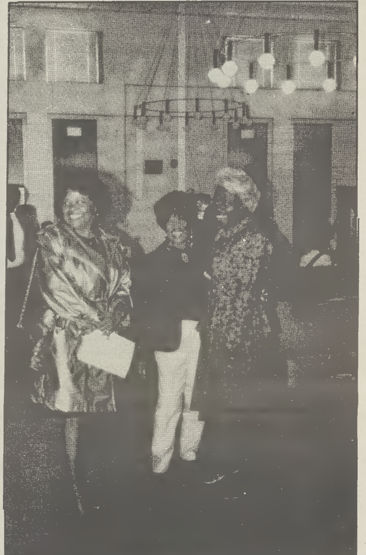
Alumni enjoying homecoming