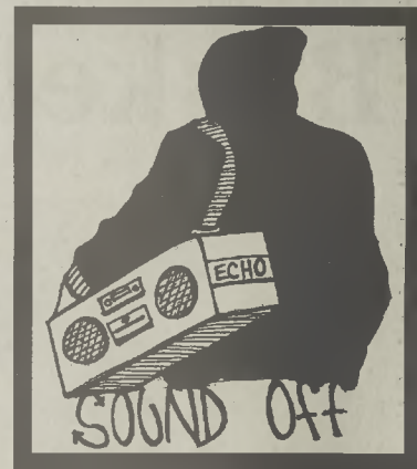
by Rashaun Rucker

perspectives? I'm not telling people that they have to accept this different lifestyle. I am saying that rejecting this lifestyle should not lead to rejecting the person's humanity. After all doesn't our shared humanity mean something? So guys, how about dropping that machismo routine a bit and realizing that you're not the target of every gay man in the world. Ladies, ditto that sentiment when it comes to lesbians. In other words, when it comes down to it, we should be treated with respect and dignity simply because we are just that—human.