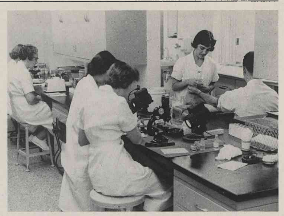
HERE IS A LABORATORY in the Out-Patient Department. A medical technician is shown as she prepares to collect a blood sample from a patient.

Any university can, with good reason, be envious of the continued dedication of our staff to the production of men, program and facilities sufficient to insure that our contribution to the health of our people will continue to be an important one.