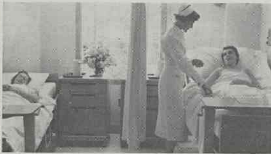
164,724 Days of Patient Care