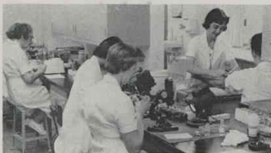
777,960 Laboratory tests