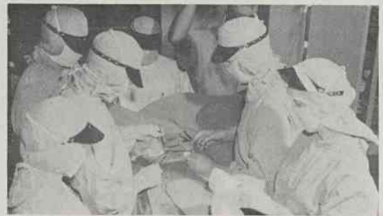
16,761 Operations, major and minor