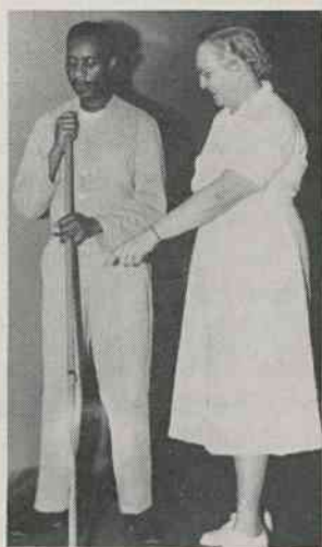
7,570,925 cubic feet of building to be maintained and cleaned