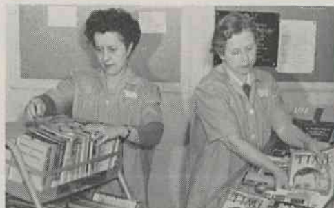
26,220 Hours of volunteer service