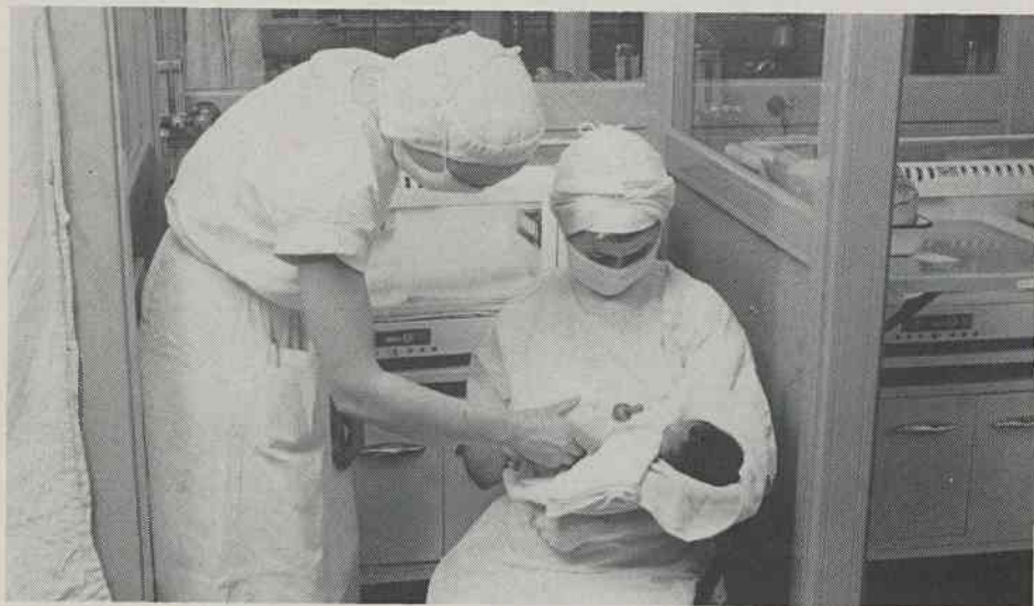
As soon as a newborn baby leaves the delivery room he goes right into the care of pediatrics' specially trained nurses. Here a wee one is introduced to the art of bottle-drinking.