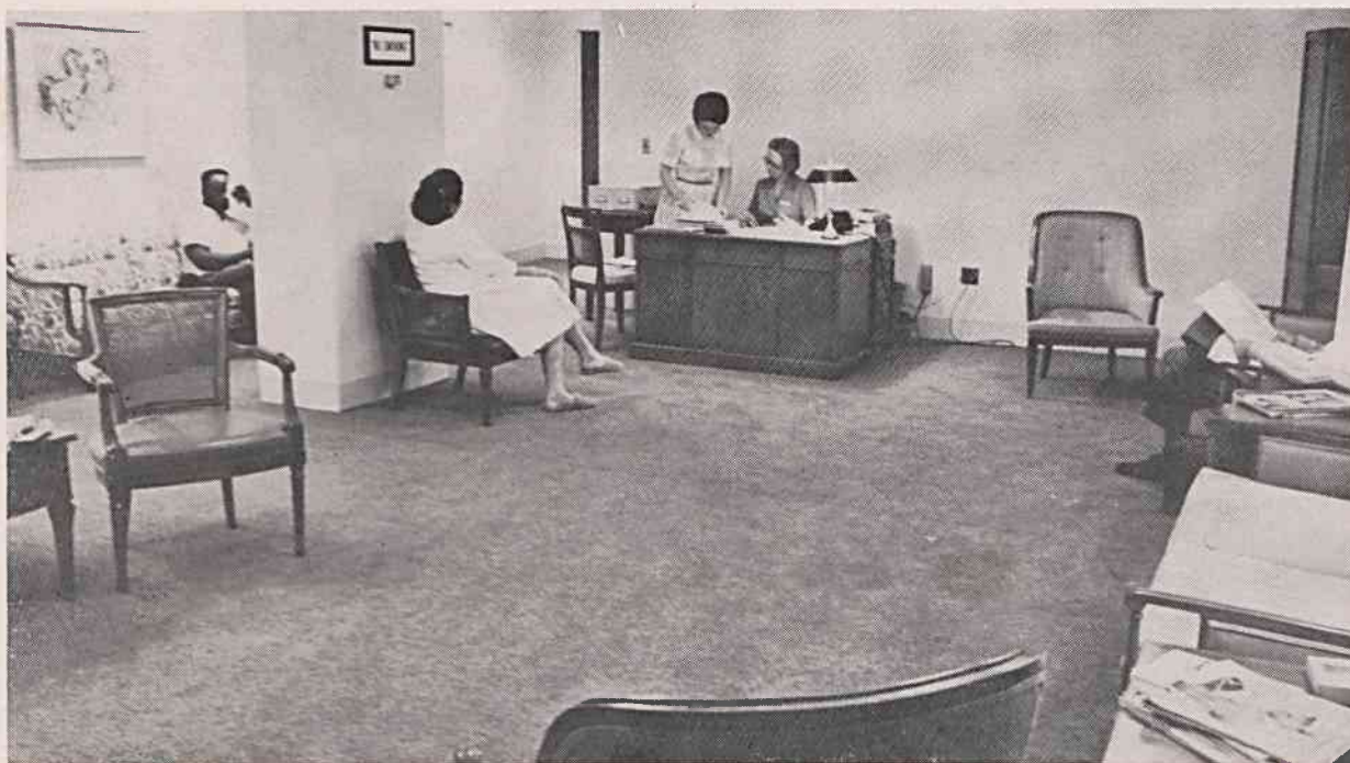
The new Ophthalmology private waiting area . . . after the renovation activity shown in the picture on page 1.