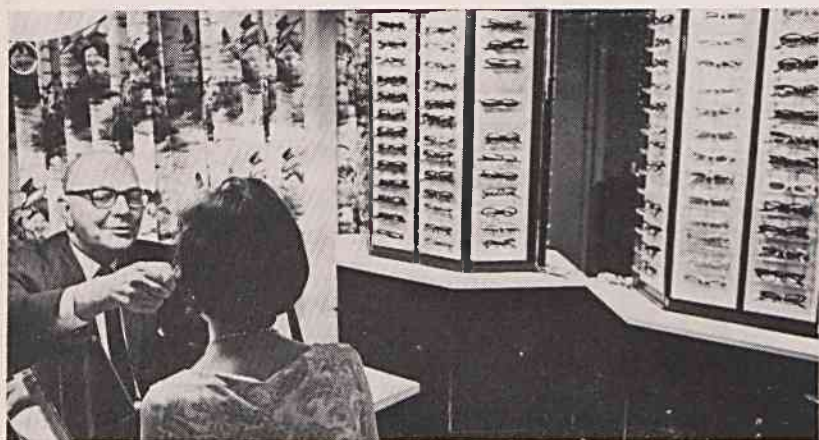
Just off the new OPD waiting area in Ophthalmology is a room set aside for an optician from a local optical company. Samples of frames are kept here for the convenience of patients.