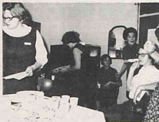
Employees combine forces to organize Christmas parties. Pictured above is a group in Baker House.