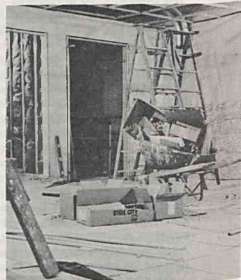
M.I.R.U. FACILITY —The Myocardial Infarction Unit on the second floor of the hospital to house a project.