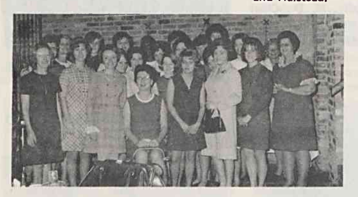
OB-GYN NURSES—More than 30 R. N.'s working on the hospital's ob-gyn wards met at a party Dec. 18.

SURGICAL OPC—Employes of the surgical OPC received the award for the best decorated clinic. The area was complete with fireplace and stockings on each door. Three administrative residents judged the entries in the annual contest. Awards were made at the administration open house held Dec. 20.