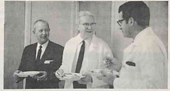
SURGICAL PDC—Employes at the surgical PDC hosted a luncheon for SPDC doctors in early December. It is an annual event.