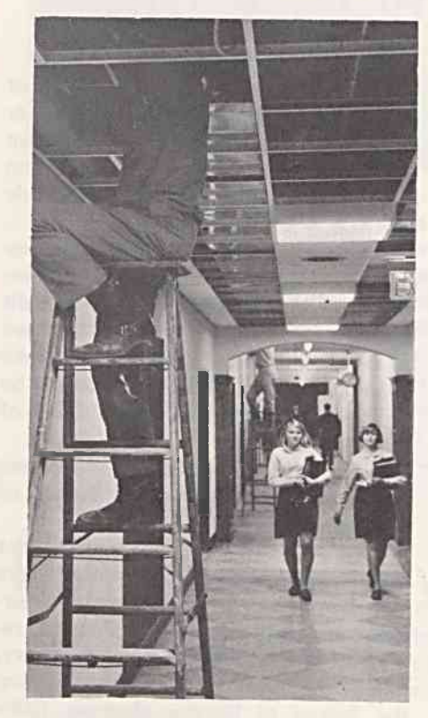
CHAPLAIN'S SERVICE—Hospital workmen install air conditioning for the new family room and hospital hostess office on the first floor near the main lobby.