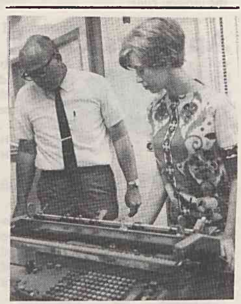
P. D. C. ON THE MOVE——Surgical P. D. C. employes help move a large adding machine into the clinic's new offices on the first floor.

It was the fifth annual symposium sponsored by the Duke Research Training Program in Sciences Related to the Nervous System. Members of the Duke medical faculty chaired each of the three sessions each day.