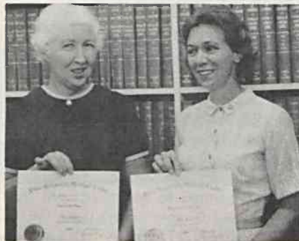
MEDICAL CENTER LIBRARY