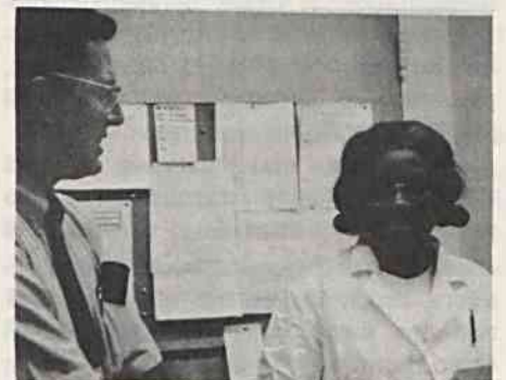
ALLERGY AND CHEST