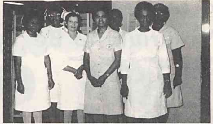
NURSING SERVICE AWARD RECIPIENTS —Some of the nursing service employes who received their 10-year awards at a ceremony in the first-floor cafeteria are pictured above. (staff photo)