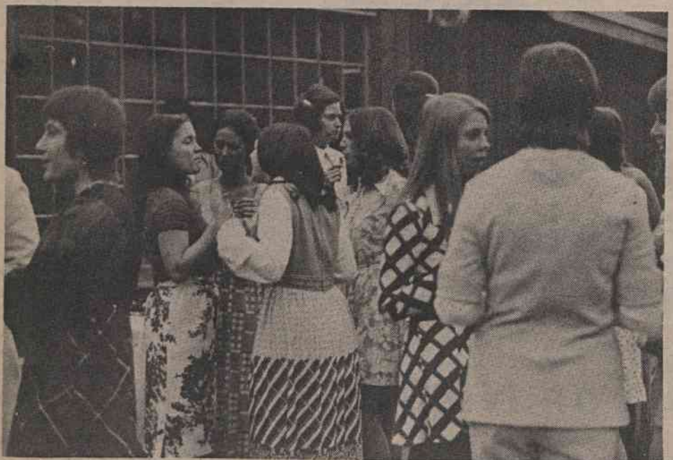
MIXING BEFORE THE MEAL—School of Nursing students, alumni and guests mingle at the Country Squire before the school's alumni dinner last week.