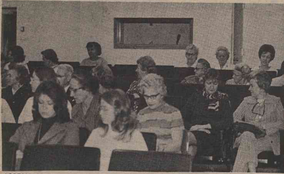
ASSEMBLY FOR NURSING DEDICATION—This is part of the group that assembled last week for dedication of the new addition to the School of Nursing. The Hanes House addition contains administrative and faculty offices, classrooms and an auditorium.