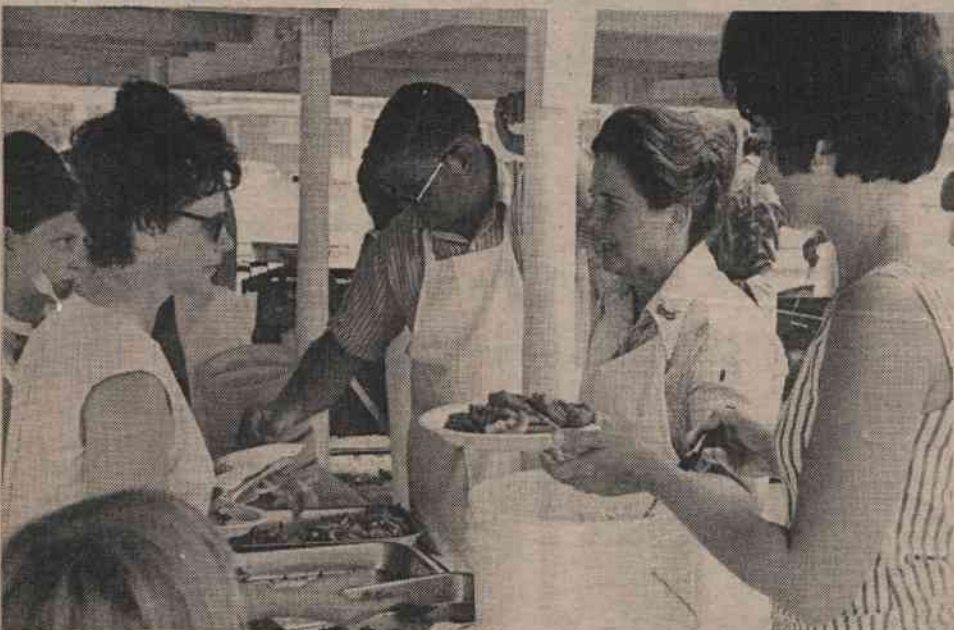
SERVING THE HUNGRY HORDES —Friends of the hospital manned their posts to dispense a wide variety of seafood at Sea Level's annual Independence Day "Down East Fish Fry."