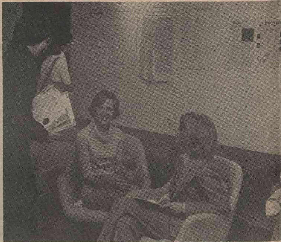
Intercom reporters received certificates (those that didn't can get theirs in 22)