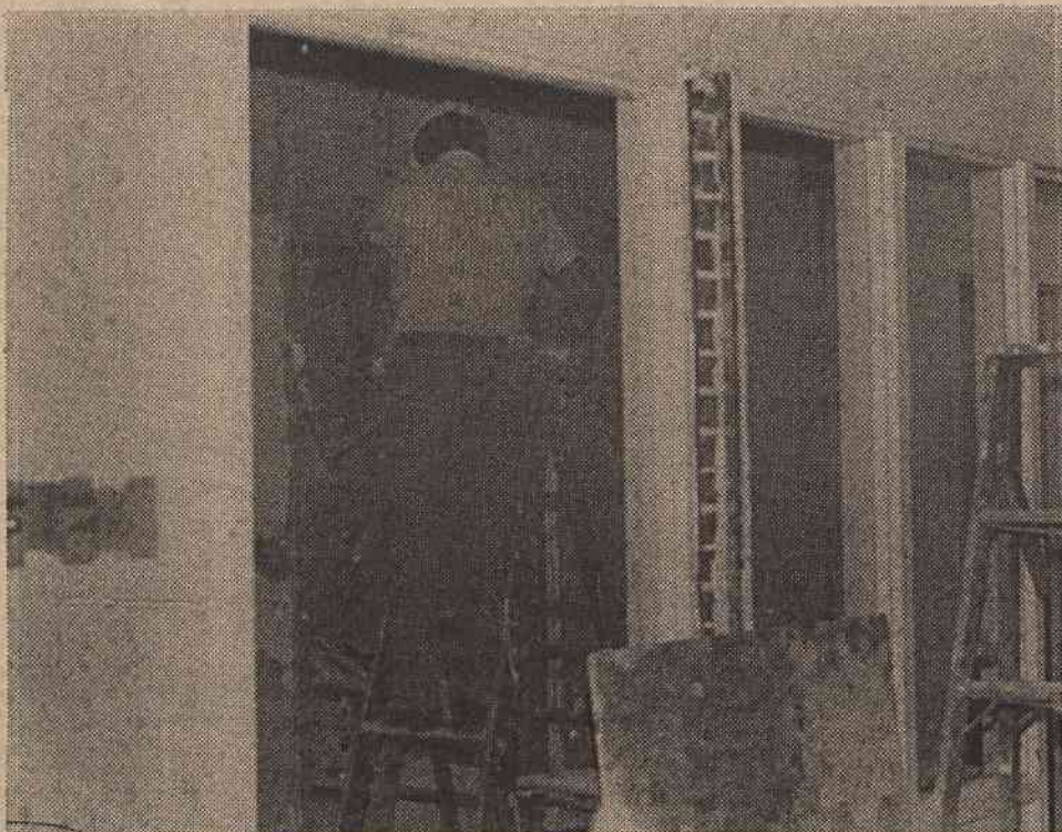
WORKING FOR THE BABIES —Construction recently completed in the Full-term Nursery will mean improved patient care by better use of existing space.