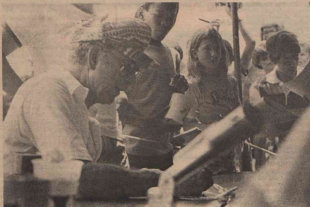
THE MAN SIGNS UP —Jack Albertson pauses between holes to sign autographs for youngsters at Duke's Children's Classic, the annual celebrity golf tournament which raises money to combat children's diseases.