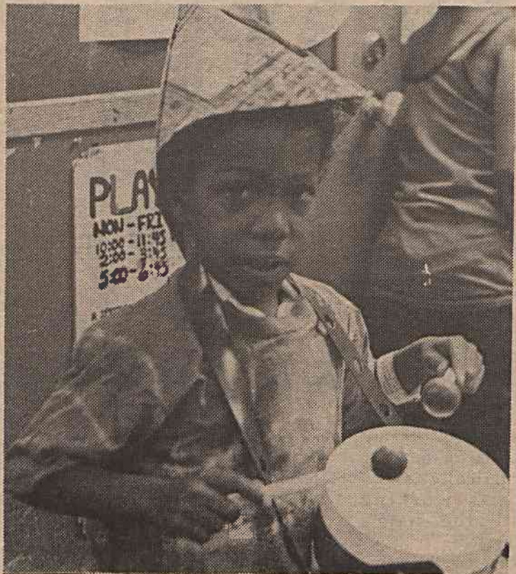
LITTLE DRUMMER —With hats and equipment from the Pediatric Playroom the children are ready for a parade around the pediatric wards.