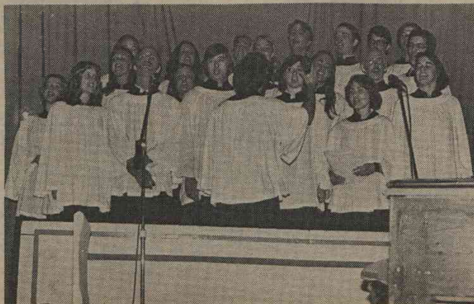
CHORAL RESPONSES were offered throughout the show by this group, rumored to be the Salzburg Choir, but looking like a group of medical students in unusual lab coats.