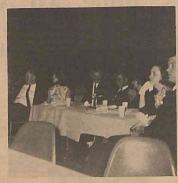
Couples at tables