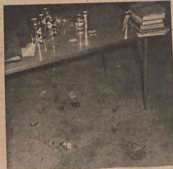
Litter in the parking lot and the student lounge.

By now you have seen, or will see, hopefully, results of a recent poll indicating that general opinion -- 65% -- holds that you -- perhaps not YOU, but some of the other students, reflect a high school spirit polluting our atmosphere.