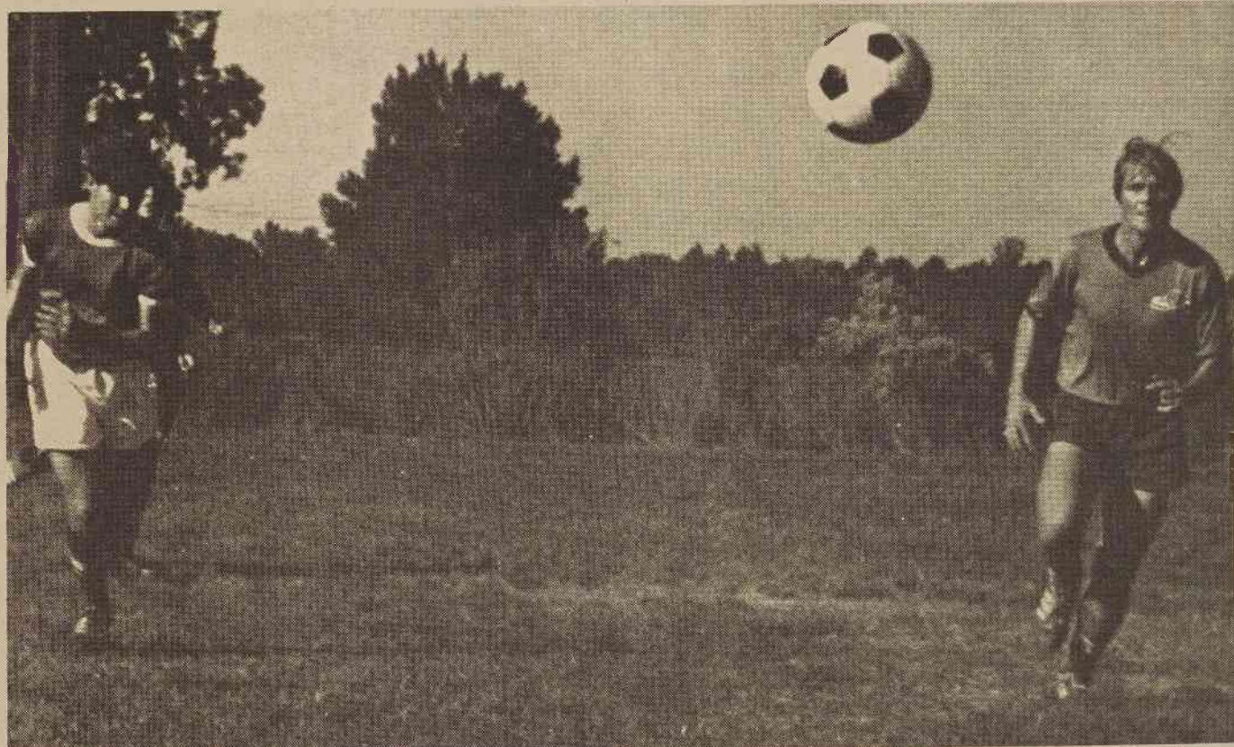
Billy Blanchard (RT) edges out unidentified UNC-W player for ball possession.