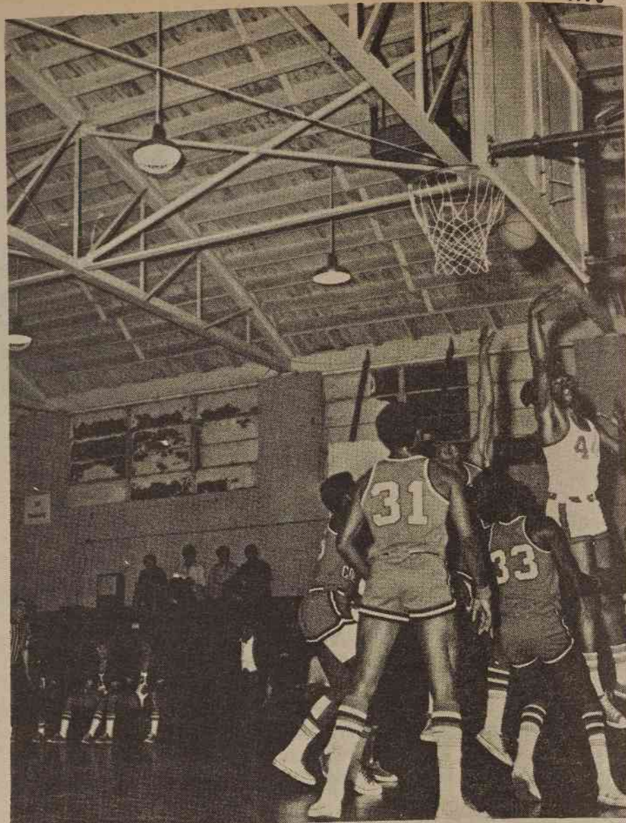
The Rams dropped their second game of the season last week.