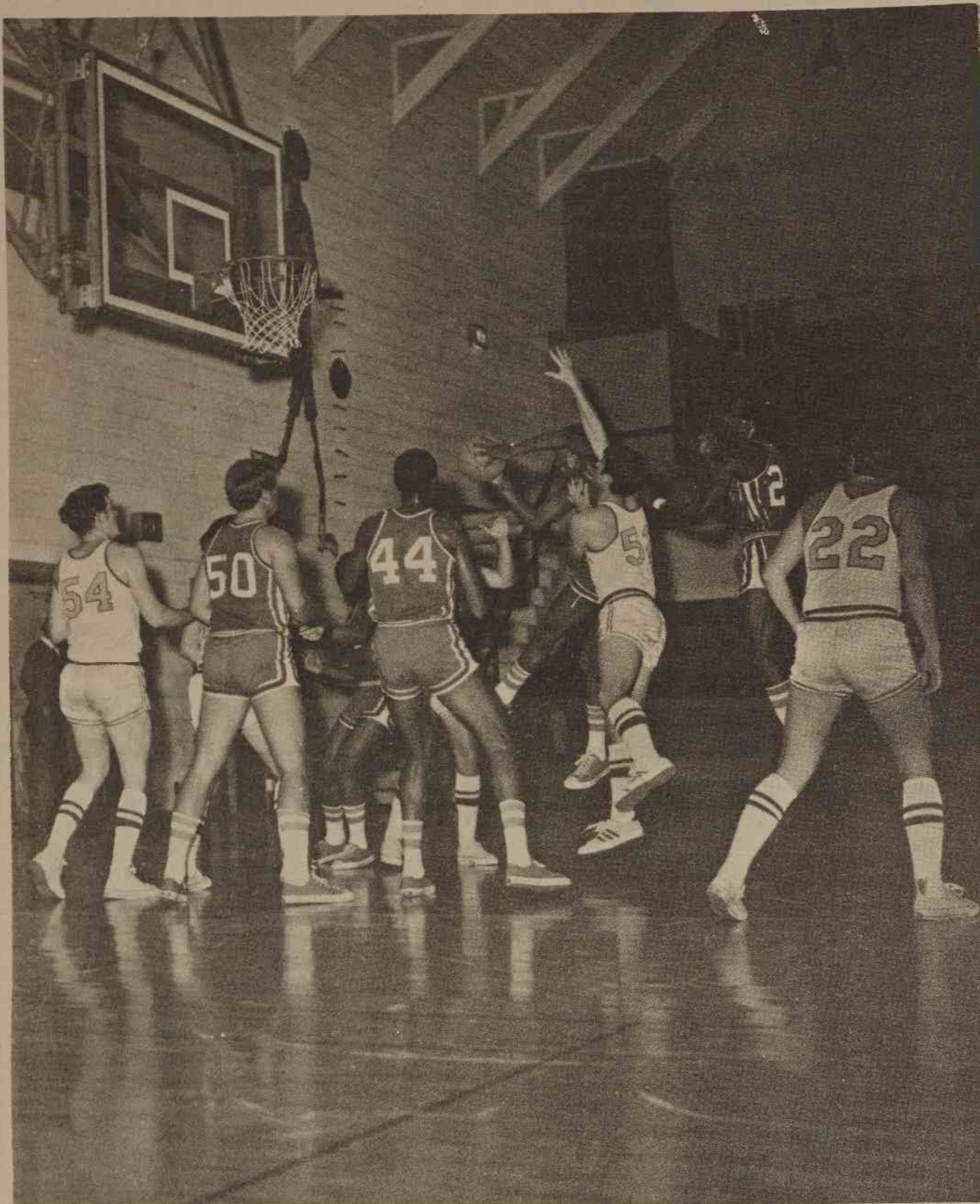
Ram's defense comes down with a rebound in their opening game against the Freshman squad of UNC-Wilmington. The SCC cagers won the game 89-63.

The Southeastern Community College Rams took an early game lead to win their opener against the University of North Carolina at Wilmington Frosh in an 89-63 defeat.