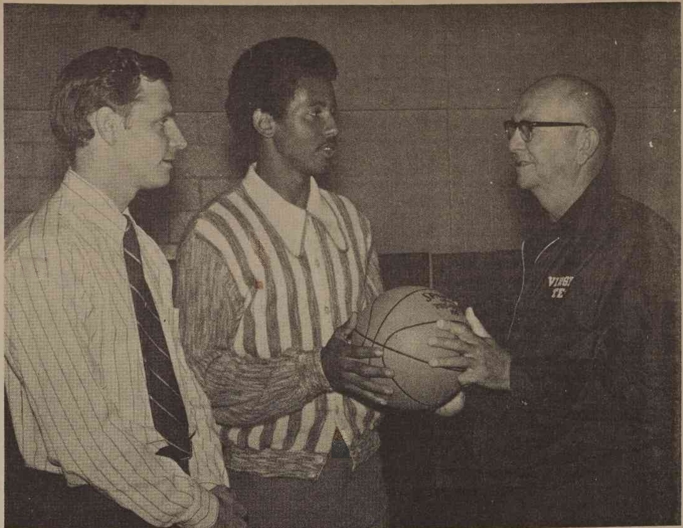
Presentation of Powers award.