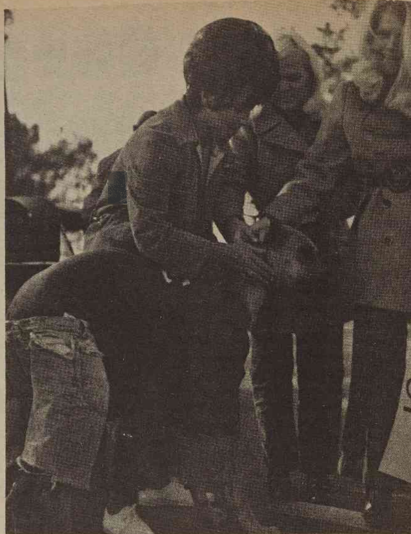
A dog's life?