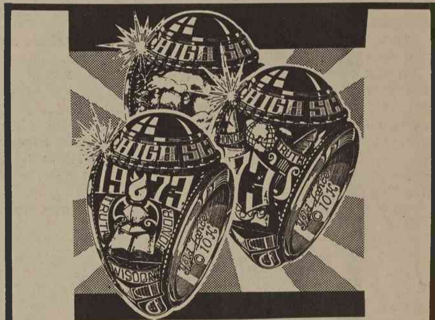
CLASS RINGS - SCC AVAIL