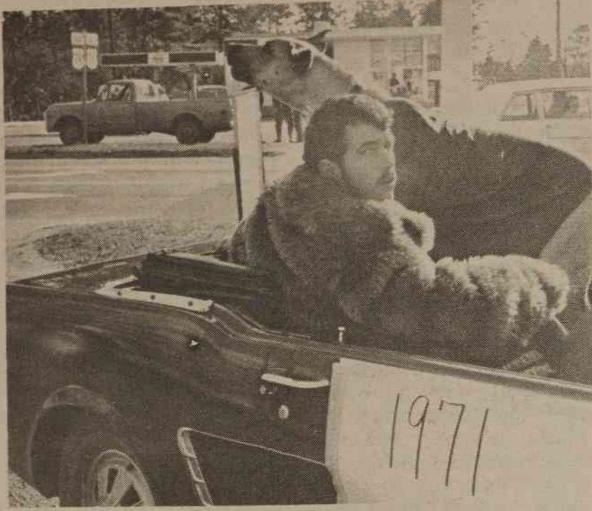
Delta Epsilon brothers.