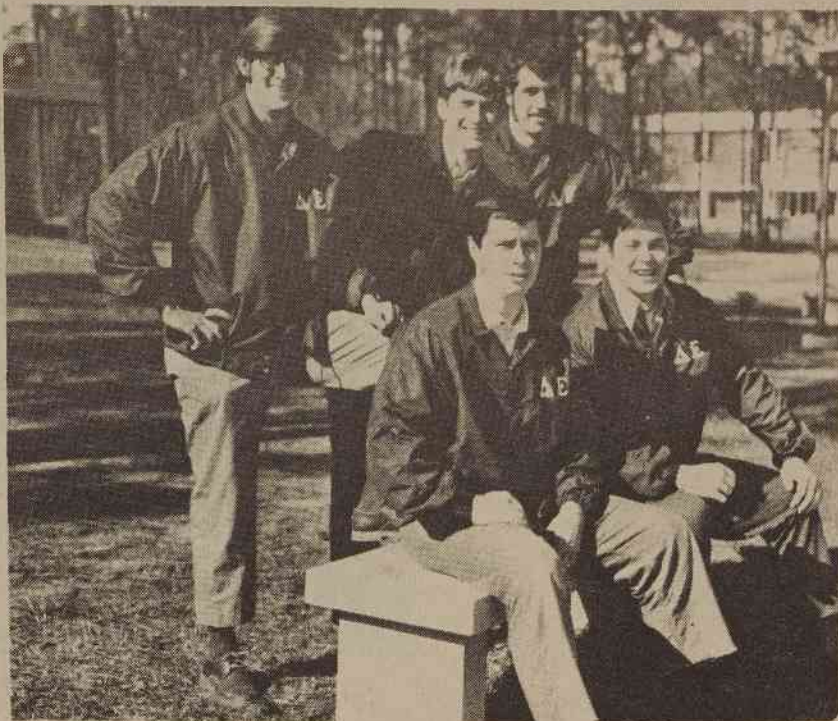
Delta Epsilon brothers.