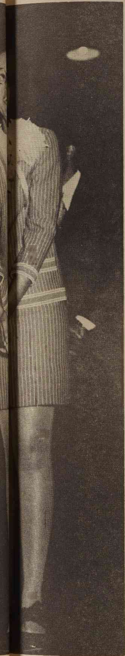
1971 Homecoming Queen