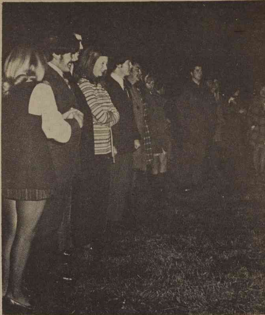
Basking in the warmth of the real cool bon fire.