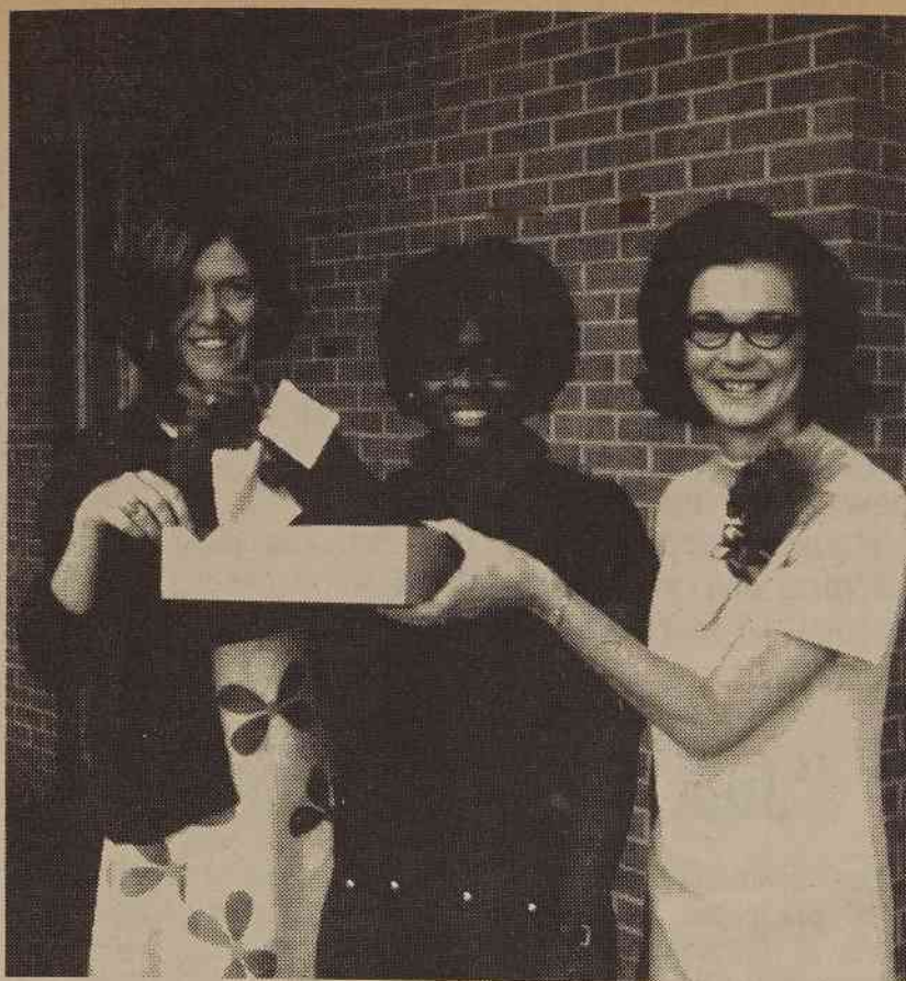
Lucky Library Winners Are Drawn