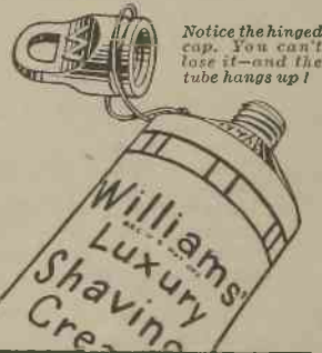
Notice the hinged cap. You can't lose it—and the tube hangs up!

Test a tube of Williams' by judging it on every point you can think of—speed, lather, comfort. See if you don't think it's noticeably better.