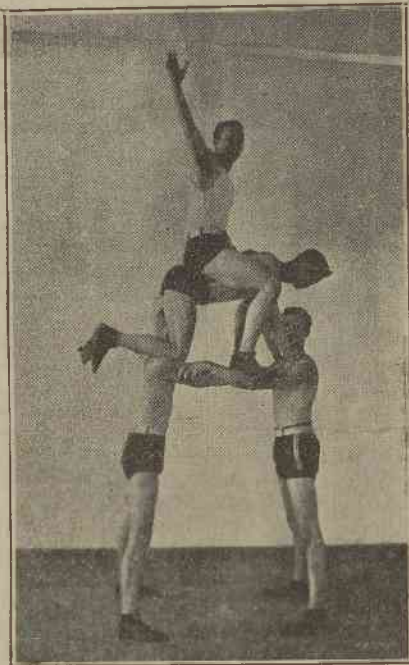
BOOSTERS' CLUB GYM. TEAM