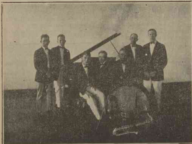
BOOSTERS' CLUB ORCHESTRA

Only the three leading candidates' records are given in this issue, however if any one has a preference for any candidate of other parties he may cast his vote accordingly.