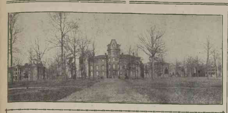
November 24, 1927