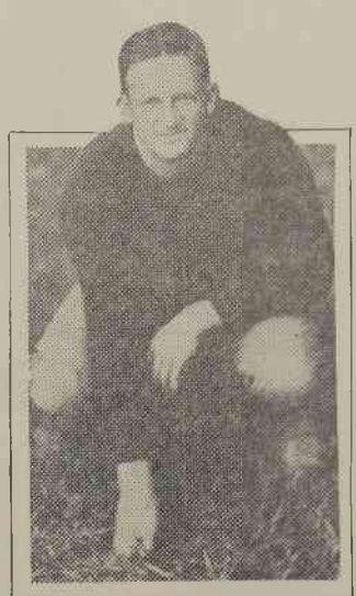
HARRINGTON - END .

During the second quarter the Bears were determined to stop the powerful Williams and his scrapping team mates who had been opening wide gaps in the opposing line. The attack was slowed up in this quarter, but the offensive (Continued on Page 3)