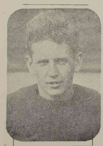
MORPHIS - CENTER

will soon vanish. Every one must develop for the good of mankind.