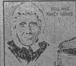
W.G. WAS NANCY HANKS