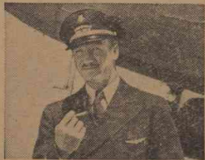
EDDIE CANTOR—America's great comic personality in a riot of fun, music, and song. Each Monday evening on the Columbia Network. 7:30 pm E. S. T., 9:30 pm C. S. T., 8:30 pm M. S. T., 7:30 pm P. S. T.