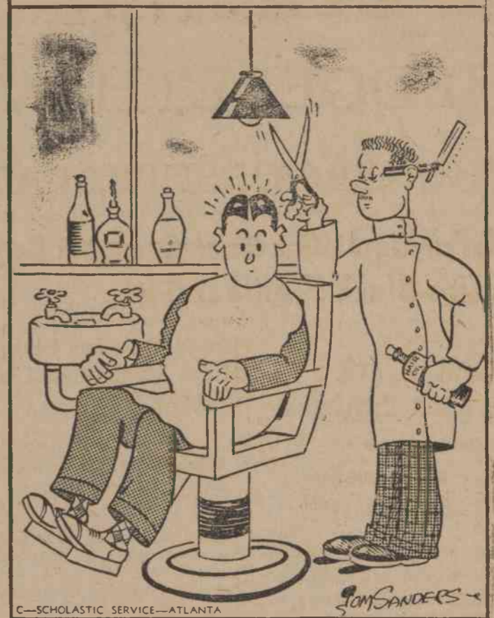
"Hair cut or oil change?"