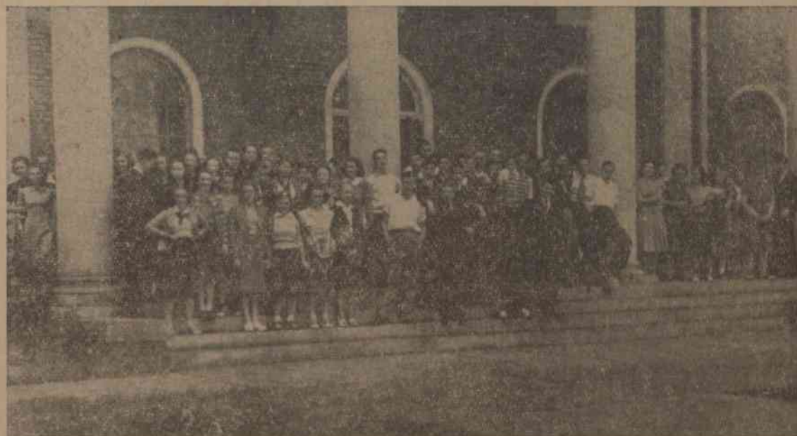
Asheboro High School Seniors who visited the campus last week to give it the once-over before they chose the school for their higher education. There were over 70 students in the group.