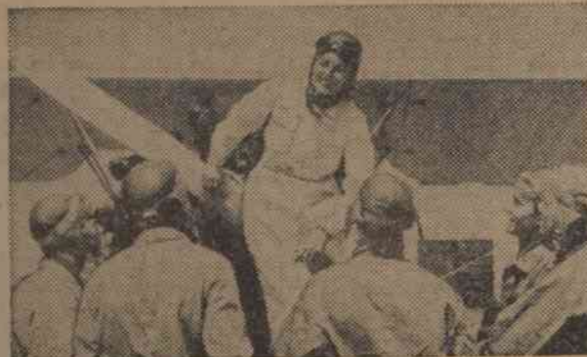
DON'T LET THOSE EYES and that smile fool you. When this young lady starts talking airplanes, brother, you'd listen, too . . . just like these students above.