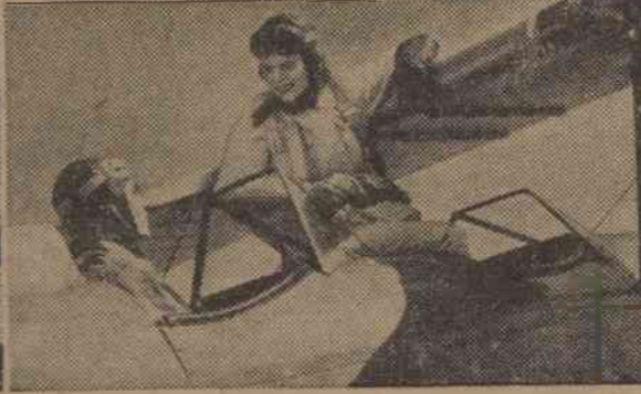
AND WHEN she calls you up for that final "check flight," you'd better know your loops inside and out. It's strictly regulation with her.