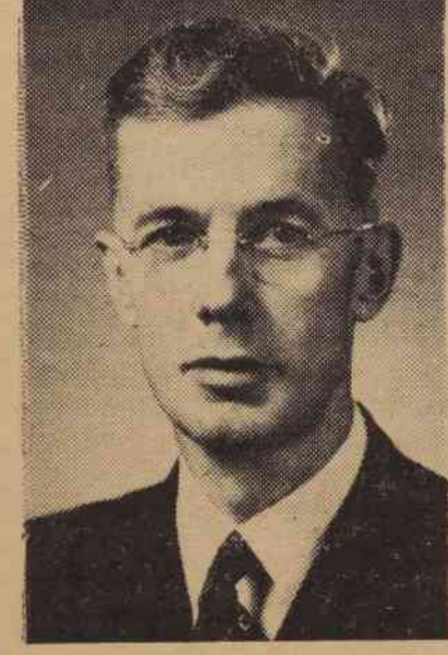
will deliver the baccalaureate ad- their characters and abilities warrant now for almost two centuries. Elondress to the seniors.

lenge To The Modern World," and er across their shoulders. The streamshowed the necessity for a union of ers of the Maypole were red, white and the classical principles of human blue. After singing the School Song, have racked the editorial brains all thought which have become a part of he court marched out. three great civilizations now influencing world religions.