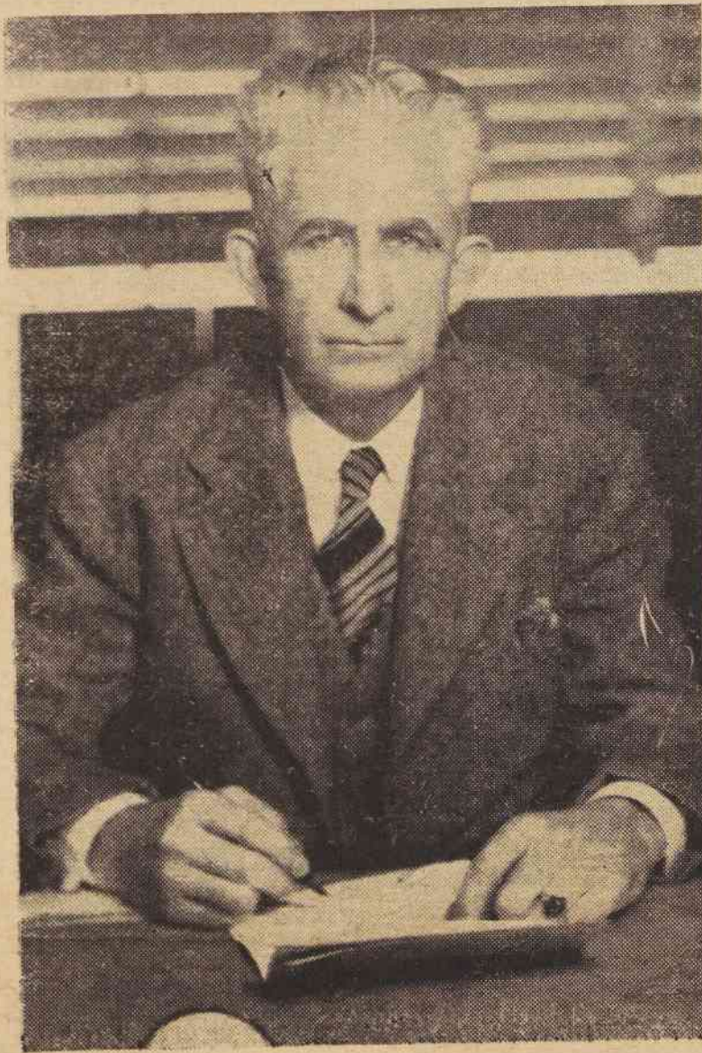
REPRESENTATIVE CARL T. DURHAM, WHO DELIVERED AN INFORMATIVE ADDRESS TO THE INTERNATIONAL RELATIONS CLUB ON ST. PATRICK'S EVE.