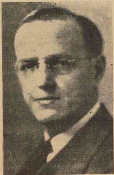
The Honorable Walter H. Judd, Congressman from Minnesota, who is to be the Baccalaureate speaker on May 25.