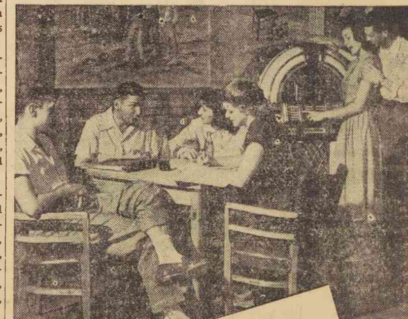
Student Union Building University, Arkansas (Fayetteville)